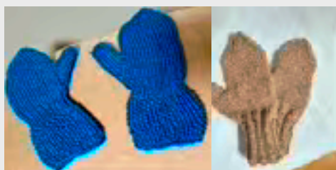
Mittens for the smallest one (5 mths).