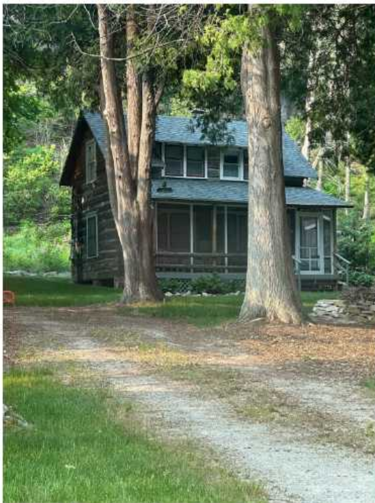
The actual cabin in Fish Creek, Wisconsin in Door County, that the book is based on.

In order: Quilters of the Door; Door to Door Quilts; The Tannenbaum Christmas Quilt; Quilted Cherries; and Christmas Surprises at the Door.