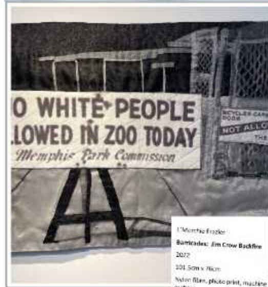
Memphis Fraggle Bannadee: Jim Crow Backfire 2022 101 Sdm x Ncm Nylon film, photocopy, machine quibag