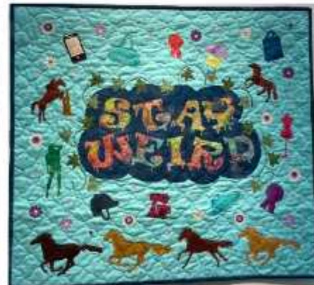
YQ-11 Machine Applique, Applé M Maxi Nylon, Nylon, LK Stay Weird Sewing Center/Instructor award 10-19 years Sponsored by brother